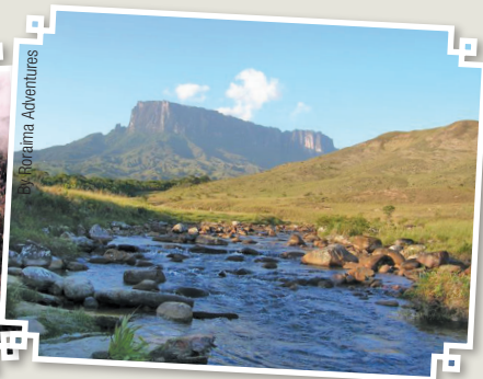
By Roraima Adventures

Rosângela describes her arrival at the plateau as "surrounded by fog, in a supernatural and mysterious atmosphere, which cleared later on, exposing the blue and sunny sky."